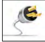
Plug & Play Packages