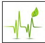
Safest PV Product on the Market

The AC Module System developed by Solar Panels Plus is a perfect solution to rising power costs, without the complications or expense of traditional PV systems.