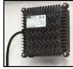
Built-In Micro Inverter